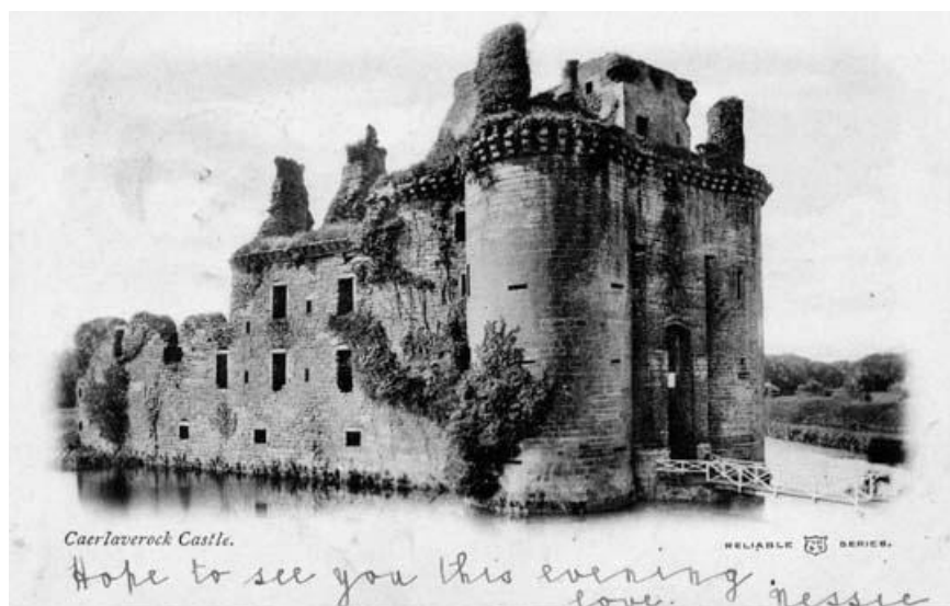
Figure 1 Early postcard sent from Lockerbie

In 1894 pictorial postcards were introduced into the UK, giving the opportunity of combining a very short message in the margin of a picture. With an increasing choice of images as printers spotted the opportunities, there was an immediate explosion in communication, as the newly virtually universally literate population grasped the opportunity for quick, informal and attractive written messages. Users were quick to combine use of the postcard image as a gift, with the appropriation of the small space for a message for their own purposes, not necessarily directly connected to the topic of the image at all; see figure 1 as an example.