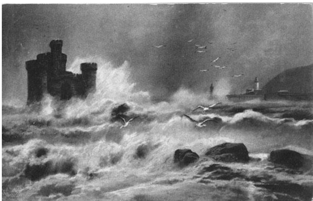
Figure 3 Postcard sent from the Isle of Man to Northern Ireland, 1909 – picture side

If one reads the message first, Frank's choice of a picture side for his communications comes as something of a surprise (figure 3); perhaps it might have been received with amusement: