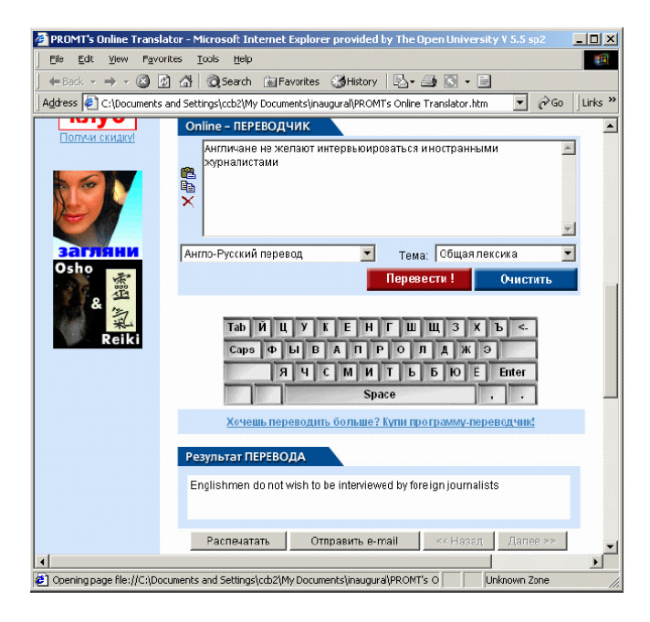
Figure 5: Screenshot of translation software

Even translation software can be useful. Such tools are often either claimed to be far superior than they really are, or dismissed out of hand as completely inadequate. The truth is somewhere in between. The following screen shot shows the apparently straightforward example of using translation software to translate a Russian sentence into English.