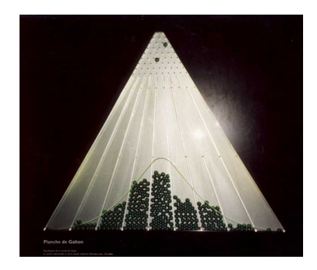
Figure 2: Spreadsheet and physical models of binomial function

So far, this is a classic example of a constructivist / situated learning approach (Abbey, 2000; Lave, 1998). What I want to emphasise here (as in the remainder of the examples presented in this paper) is that: