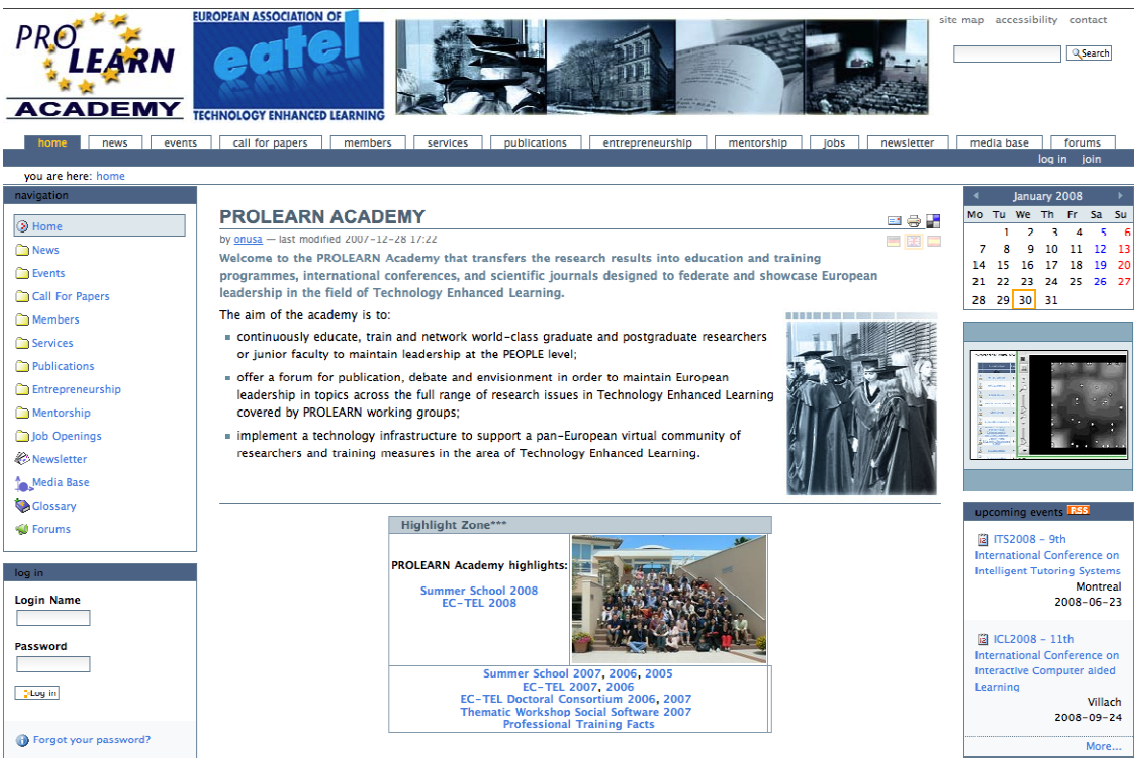
Figure 1: PROLEARN Academy Portal for training of PhD students (screenshot)

One of the successes of the network is that all events and tools survived the funding phase of the network. In 2009 there will be again a summer school funded by a consortium of almost every funded TEL project in Europe and a doctoral consortium at the EC-TEL 2009. Also the mentorship database was recently updated to cover new Web 2.0 tools and thus enabling better connectivity among the former PhD students. Moreover, students now can enter links to their published thesis work. This helps distributing research results in the European TEL research community. For a deeper analysis of the impact of the events organized by the PROLEARN academy we constantly monitored the use of the portal and all services mediated through the portal.