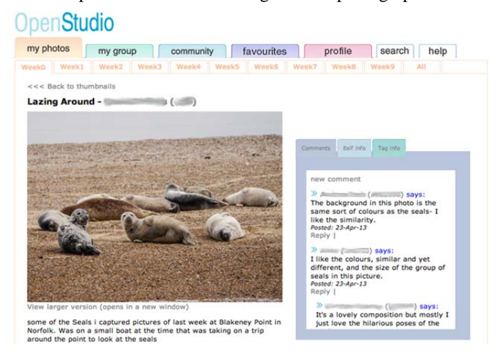
Figure 2 Peer feedback given on a photograph in OpenStudio (Digital photography)

OpenStudio was first developed for use on the UK Open University 10-week course Digital photography: creating and sharing better images. This course aimed to help students to develop their technical, visual and creative skills in photography, and to learn about the technology of digital photography. The course attracts between 400 and 1500 students each presentation (a total of 14,650 in 14 cohorts). There is no individual tutor support; instead students share their photos in OpenStudio and build up a portfolio to submit as part of the endof-module assessment. By discussing and critiquing each other's work in a controlled, supportive environment, students are helped to develop their visual awareness and ability to reflect on and articulate their skills. Small peer groups are recreated every week from those students who are currently uploading photos; this ensures that students meet a wide range of peers but can also follow individuals should they wish. Figure 2 illustrates how the OpenStudio space is used for peer feedback on a user-generated photograph.