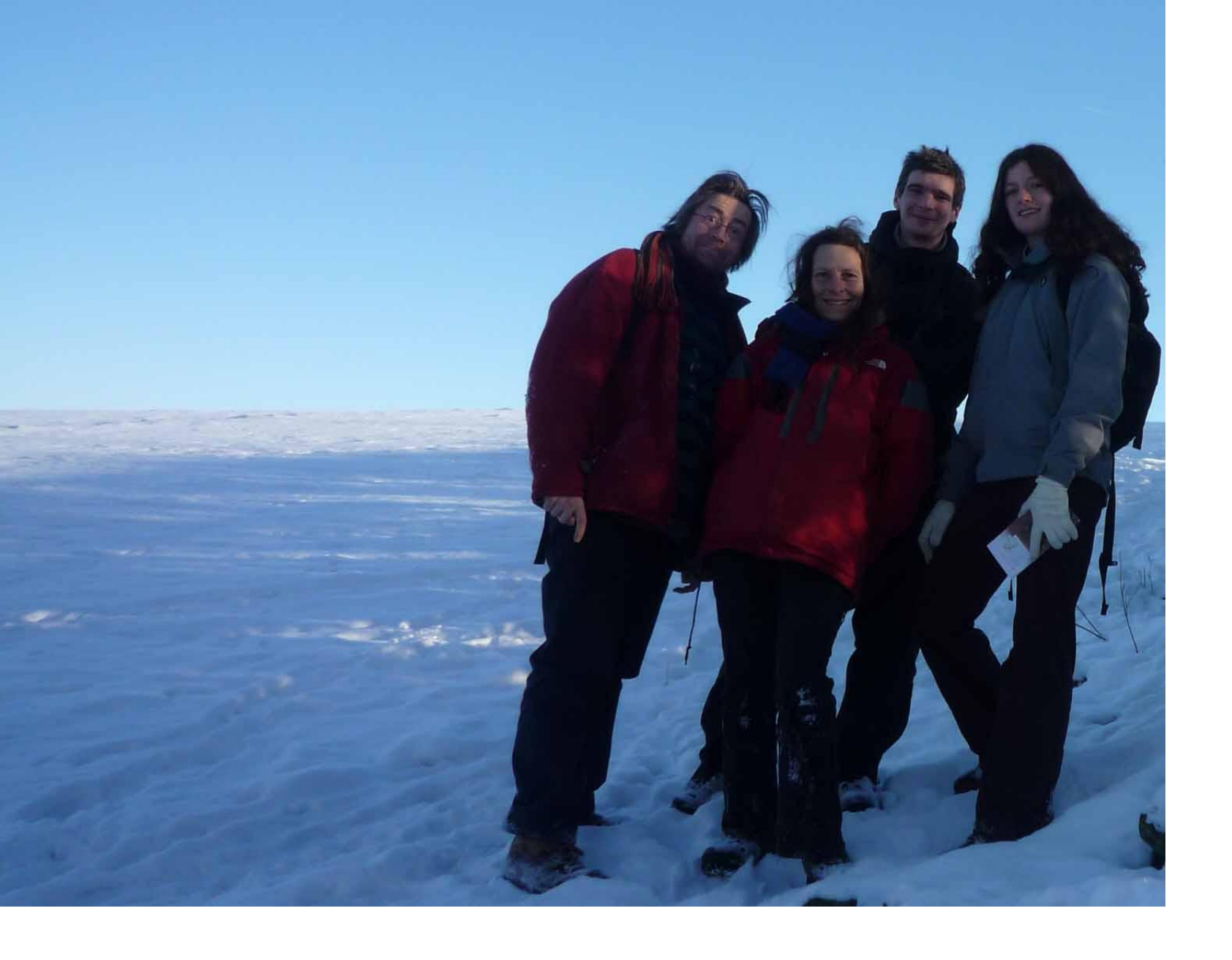
Greetings from the snow theorists